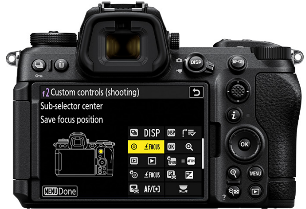
Z6iii Setup Worksheet