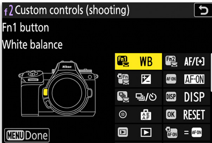
Custom Settings > f2, default settings shown

This PDF is designed to help you set up your Nikon Z6iii shooting controls, located under Custom Settings > f2 Custom Control (shooting) .